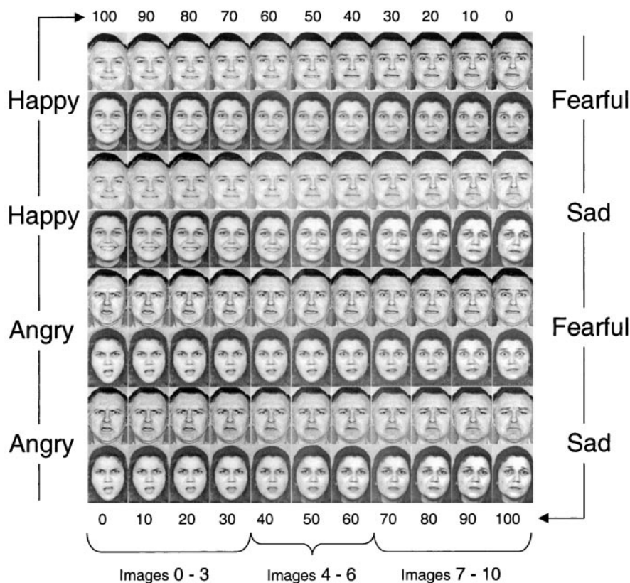
Fig. 1. The stimuli. Children categorized randomly generated “morphs” from blends of four prototypes. Morphed images were created to lie between prototypes of happiness and fearfulness, happiness and sadness, anger and fearfulness, and anger and sadness. These four continua each contained 11 male and 11 female images, of which the end positions were unmorphed prototypes of each emotion. The images each differed by 10% in pixel intensities. The middle face in each continua was a 50% blend of each emotion pair. (Adapted from ref. 18.)

Stimuli. Two posers (a female and a male, shown in Fig. 1) were chosen as prototype images from a set of published photographs (18). The prototype images were scanned to 213 \times 480 pixels and morphed to produce a linear continuum of images between the two endpoints. For each continuum, pertinent anatomical areas such as the mouth, eyes, nose, and hairline were used as control points. To create the morphed transformation, the pixels around key points were changed from their positions in the start image to their positions in the end image, and their colors were transformed from one image to the other by a Delauney tessellation procedure based on linear triangulation of elements. An important feature of this procedure is that control points are shifted by an equal percentage of the total distance between their initial and final positions.